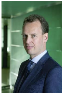
Frank Elderson ECB Executive Board Member