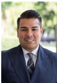
Commissioner Ricardo Lara Insurance Commissioner State of California